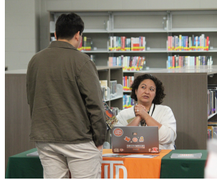
Hendrix College interacts with another university colleague.

Students take opportunity to explore colleges right from the campus library.